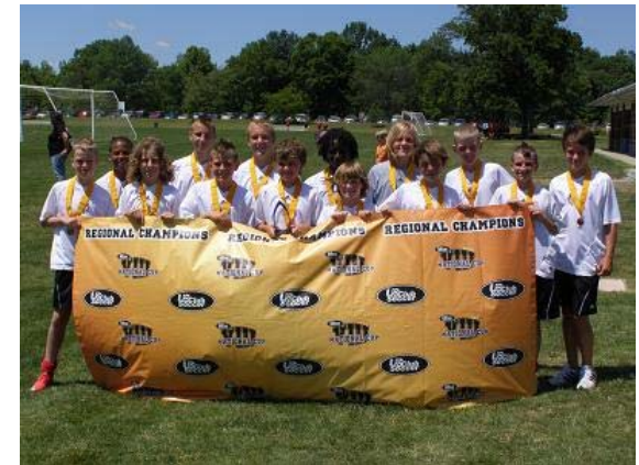
Springfield S.C. 96/97 Boys US Club Soccer Region D Champions

“Where Good Teams Begin the Road to Becoming Great”